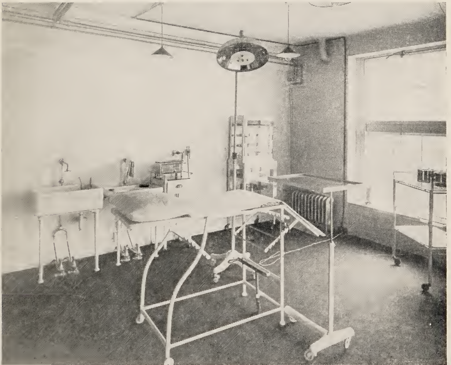
ORAL SURGERY THEATRE.